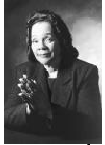
1927 – 2006

Mrs. King was an inspiration around the world who never gave up fighting for Dr. King's – and her own--dream of racial peace.