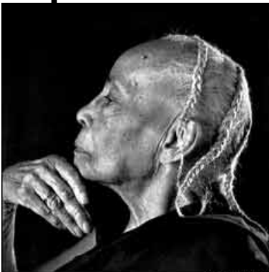
1898 – 1987