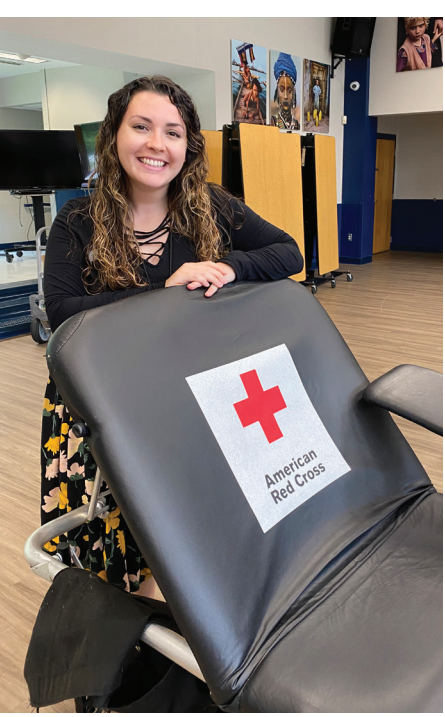
Students, teachers, staff, parents and other STM community members all contributed!

Fall 2022 | Newsletter of Saint Thomas More + A Catholic School in the Jesuit Tradition